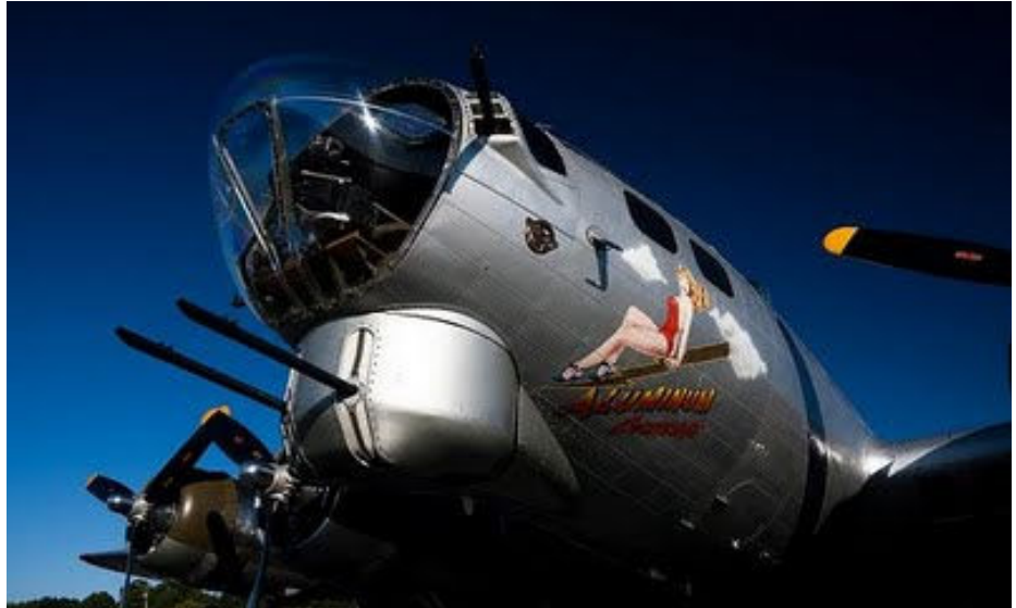
Members of ARC and GARS participated in a Special Event Station in October to commemorate the annual visit of the Aluminum Overcast to Gwinnett County's Briscoe Field. The event was sponsored by EAA